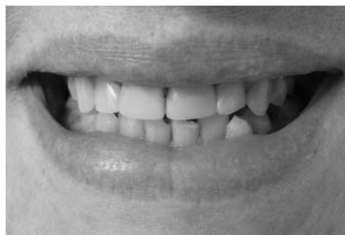
A life-change restoration by CVIM.