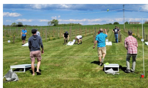
Centre County Cornhole Classic