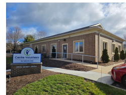
Sandy Drive Clinic