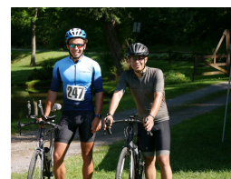
Central Cycling Classic