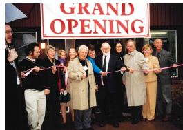
Easterly Parkway Clinic

Thanks to donors like you, CVIM is now located at 2026 Sandy Drive with 11,000 square feet of technologically up-to-date clinic space.