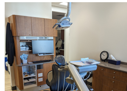
Sandy Drive Dental Room