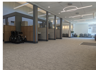
Sandy Drive Reception Area