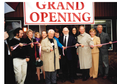
CVIM Grand Opening